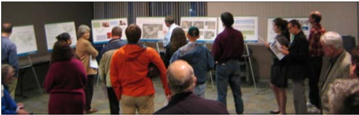
January 22, 2013 Public Open House