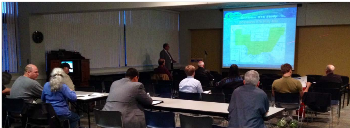
February 26, 2014 Public Meeting