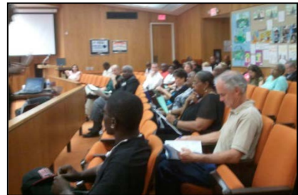
Black on Black Crime Task Force