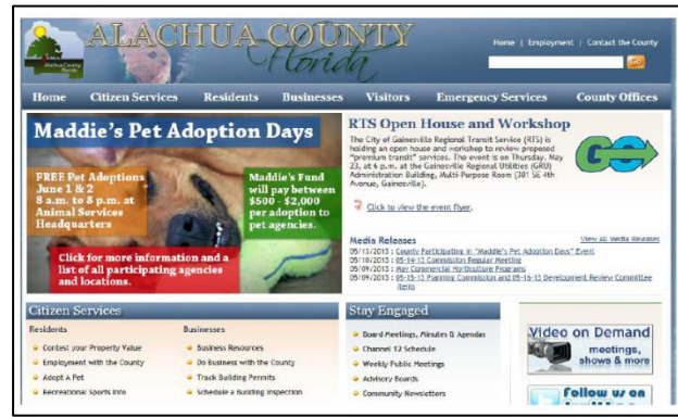
Alachua County Website