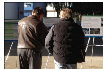
Santa Fe College