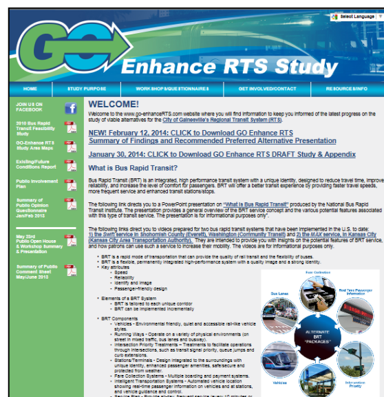
GO Enhance RTS Website

A variety of outreach tools were used to communicate and engage the public. These tools include the GO Enhance RTS Study website, www.go-enhanceRTS.com , open houses, information booths, presentations/workshops and attendance at community group meetings. The website provided updated project information, announced public meetings and forums to obtain study information and contained contact information. The project website was designed to allow community comments, suggestions, questions, complaints, and includes search options. Project presentations, maps and even interactive questionnaires/comments pages are located on the website. Google language translation is provided on the Study website to allow all viewers to read the website in their language of preference. Between January 20, 2013 and April 19, 2014, the project website was viewed nearly 5,000 times. Gainesville RTS and Alachua County also announced upcoming meetings and provided links on their websites to www.go-enhanceRTS.com .