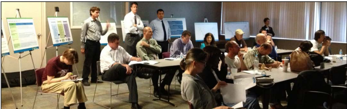
May 23, 2013 Public Open House and Workshop