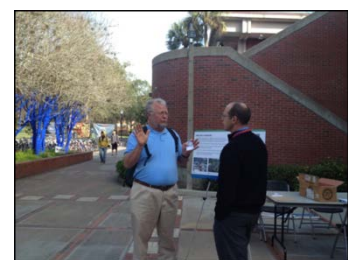
University of Florida